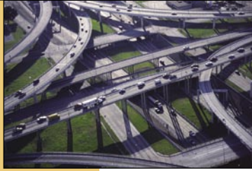
Using CADconform since 2002

“The last issue of our official state map had more than 69,000 individual elements on it and the front cover alone had 17,000. Each one of those elements represents a possibility to make a drafting standards mistake. CADconform eliminates 100 percent of those possibilities,” according to Assistant Manager of Cartography Fred Holthaus. “Before CADconform ... there was just no way, no mechanism, to check every element on each and every map file – it was humanly impossible to assure 100% accuracy,” asserts Holthaus.