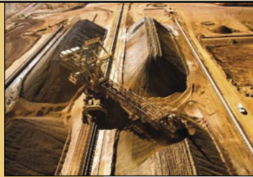
Using CADconform since 2002

With CADconform, BHP BIO has been able to measurably improve efficiency and productivity for both in-house and consultant-contractor drafters with estimated savings of $3.25 million USD per project. The software has also enabled them to facilitate management of large-scale multi-vendor projects by streamlining the assignment and reception of CAD drawing files and assuring 100% conformance to CAD standards. “CADconform is cutting edge technology for the use of standards. It’s the critical piece for companies to be able to reliably, affordably and successfully implement CAD standards,” says Michael Hallam, Administrator of CAD & Technical Information for BHP BIO.