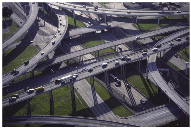
For Kansas DOT, CADconform is a critical component for meeting new federal government requirements resulting from problems during evacuations for hurricanes Katrina and Rita in 2005.

But the assurance of accurate, standards-conformed maps have also allowed them to realize long-term strategic value for all of KDOT and the other state and federal agencies that depend on the mission-critical data and information that they gather, produce, maintain and provide.