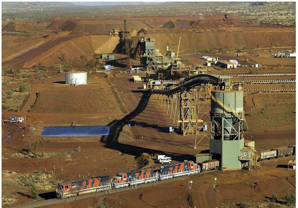
Mine Operations Area C Processing Plant of BHP Billiton Iron Ore operations in Western Australia.

In today’s competitive and demanding economy, companies have an ever-increasing need for the types of benefits, efficiencies and competitive advantages that can be gained through use of CAD stan-